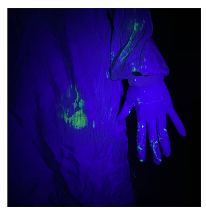
Figure 2: Intubator heavily contaminated with fluorescein on hand, forearm and torso highlighted with ultraviolet light after performing an intubation on a manikin covered by a plastic sheet.

A sample size of convenience of 5 participants was chosen because of time and resource constraints during the